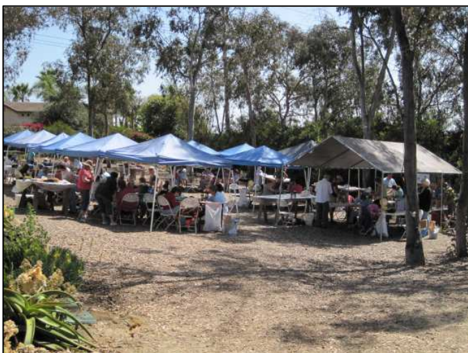
Classes in the Eucalyptus Grove