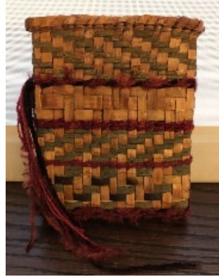
Candle Top - $155 ($80 + $75 material/ prep fee) Saturday