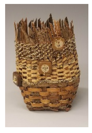
Textilizing - $175 ($80 + $95 material/ prep fee) Sunday