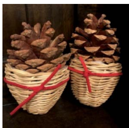
Example of November 5 Mini-Workshop

Following these activities, fellow Guild member Marsha Orr will teach a fun mini-workshop. Using round reed, she will teach students how to create an adorable mini-pinecone ornament for your tree or packages. A leather strip in your choice of colors will be added as an embellishment. All supplies will be provided (the pinecone topper must be glued on after the woven base is completely dry). There is a small fee for the mini-workshop.