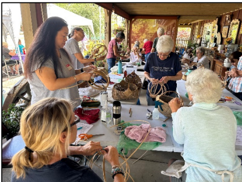
2023 Basket Day Classes & Some of the Basketry Supplies Available

PLEASE HELP YOUR GUILD to continue to succeed and grow by stepping up to be Chairperson of this important Committee!